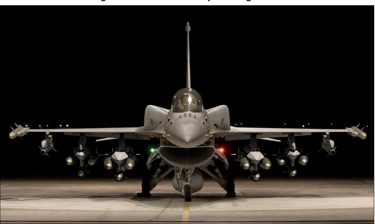
Figure 1. F-16 Block 70/72 Viper Configuration